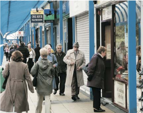
Port Talbot Town

Our shared priorities for this Plan and specifically for this theme centre upon improving the quality of life and local services for local communities. This requires effective partnership working, strong community and political leadership and effective community engagement.