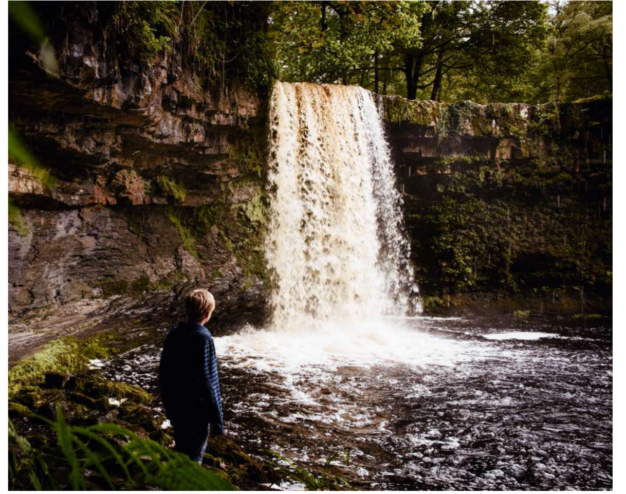
The existing visitor facilities do not create an adequate gateway to the Waterfall Country.