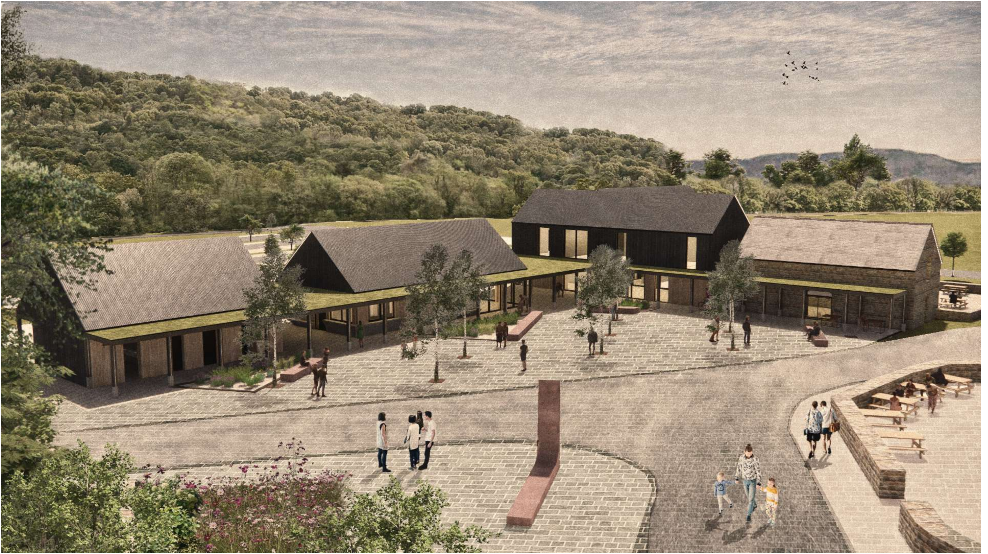
The built elements are composed as a collection of pitched roof 'barn-like' volumes connected by a lightweight external colonnade which will provide shelter and opportunities for interpretation.