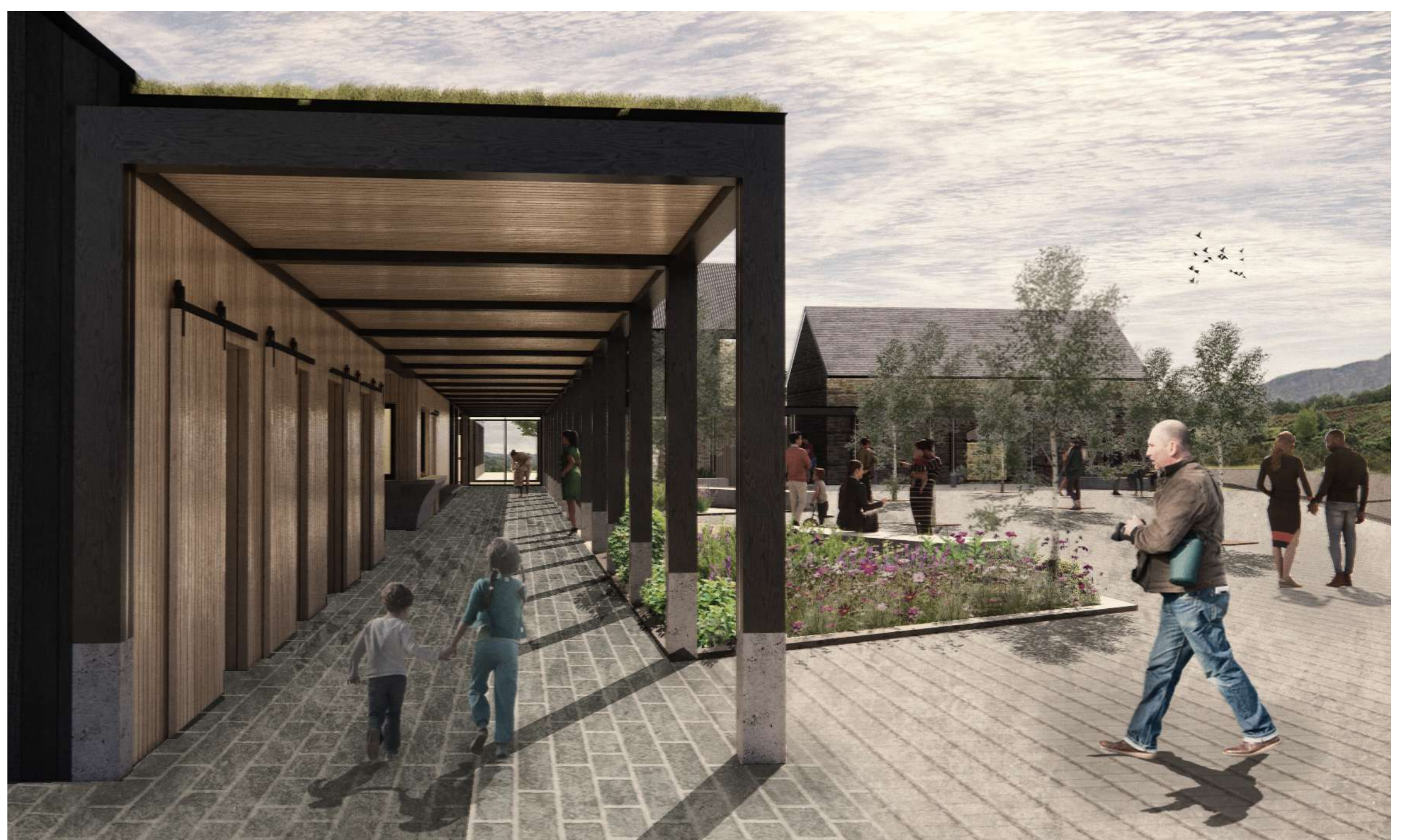
View along the colonnade that forms the edge of the public square

The hub and accommodation is linked by a covered colonnade providing shelter and areas to collect, with integrated local and visitor information telling the story of Pontneddfechan and the Waterfall Country.