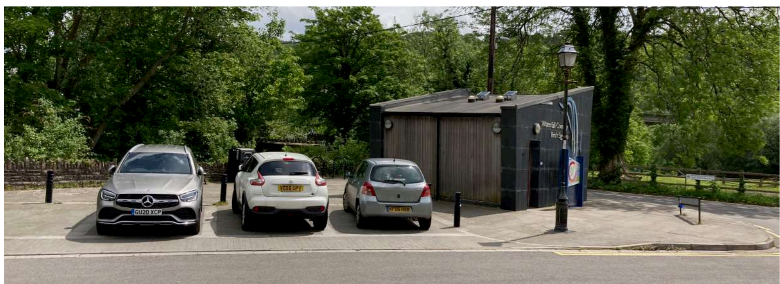
The village is dominated by parking at peak visitor periods. There is lay-by parking along Pontneathvaughan Road but this has no dedicated pavement and pedestrians must cross the road between cars. 4 free parking spaces sit alongside limited WC provision.

The proposed site is in a prominent location, simultaneously at the centre of the old village of Pontneddfechan and on the edge of open countryside.