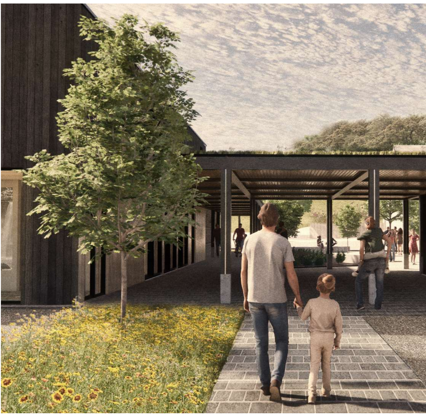
Gaps between built elements provide gateways for pedestrian movement from parking areas to the village square. The openings also align with key views from the car park towards the village square or out from the square towards open countryside.

Context Analysis of the development site has guided a design response comprising: