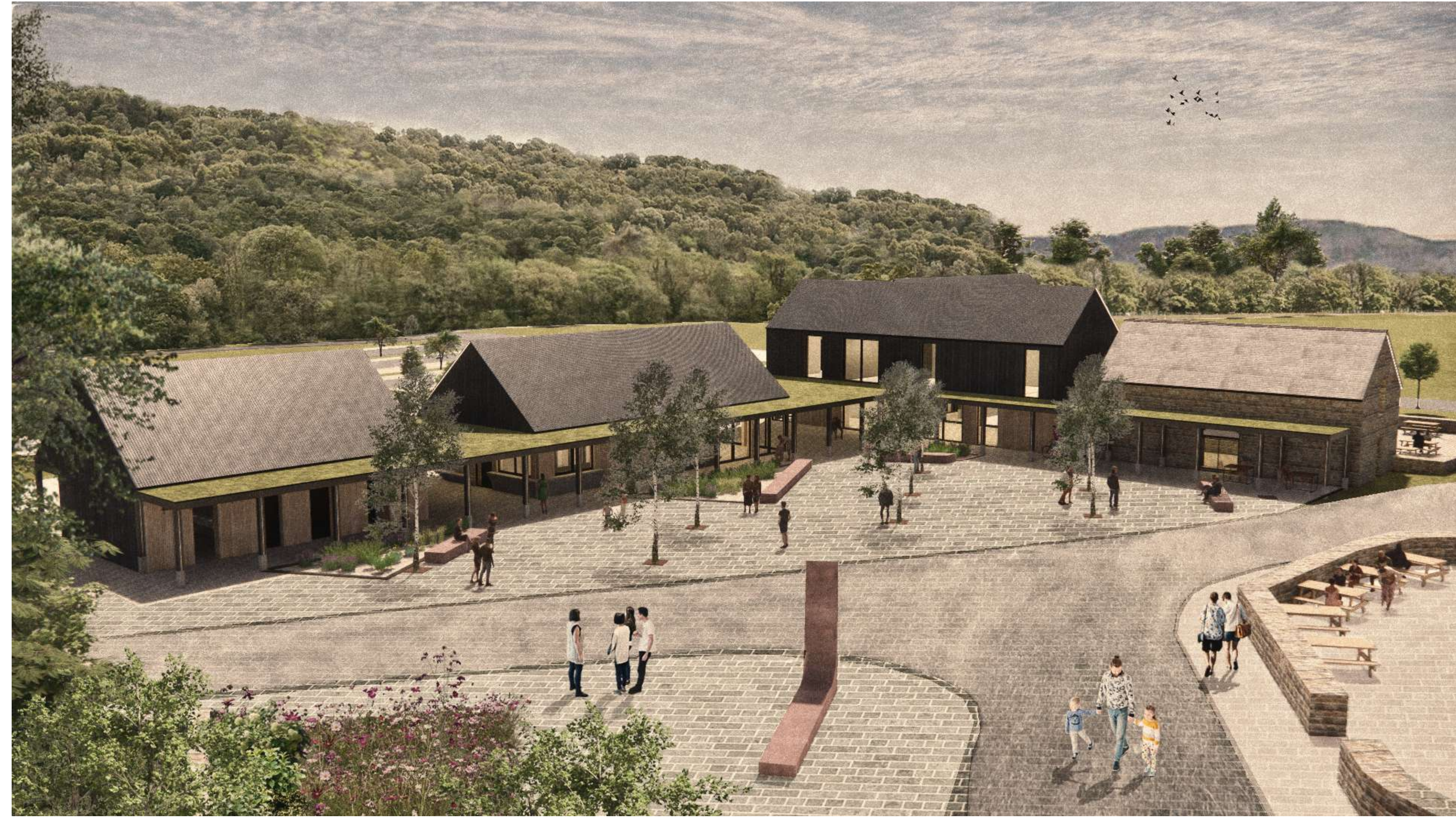
The built elements are composed as a collection of pitched roof 'barn-like' volumes connected by a lightweight external colonnade which will provide shelter and opportunities for interpretation